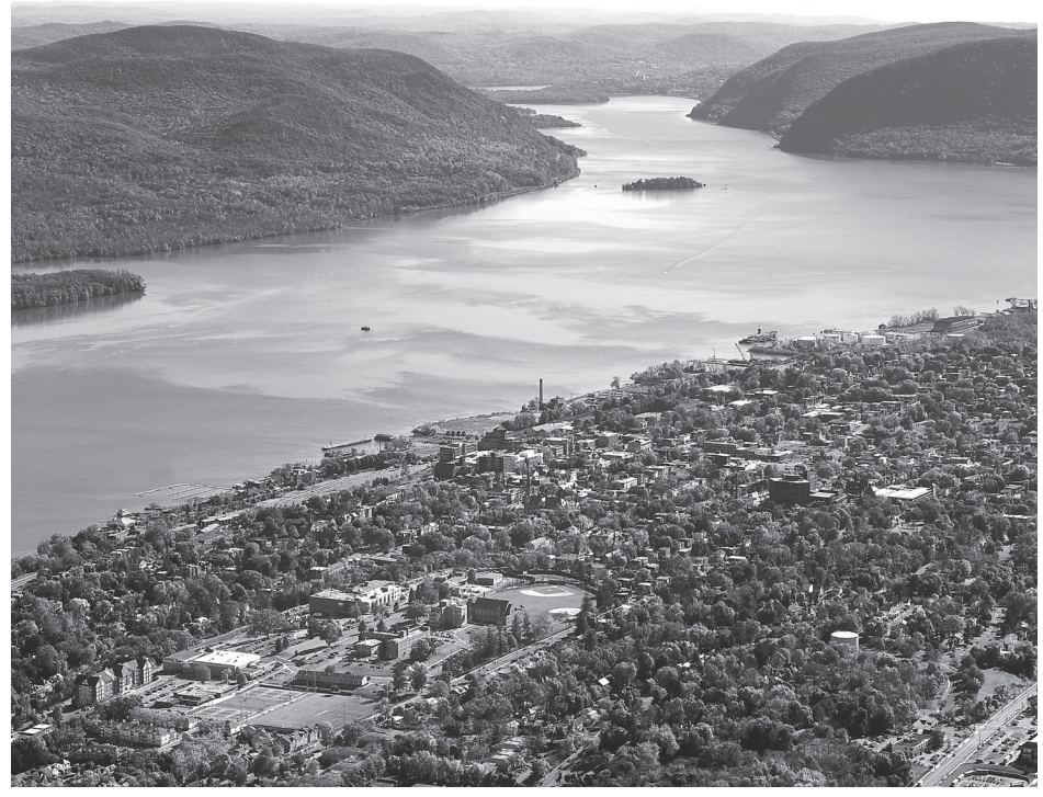
Aerial view of Mount Saint Mary College and the Hudson River.

Guzman Hall , built in 1963 and recently renovated, is a multipurpose residence hall that also houses Founders Chapel and the Health and Wellness Center.